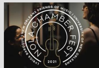
March 18 - 22, 2021