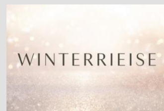
December 17, 2020